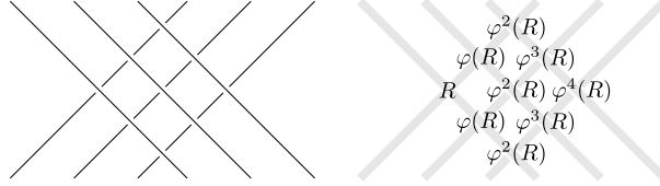
FIGURE 1. Illustration of {}_3R_3 = \varphi^2(R)\varphi(R)R \cdot \varphi^3(R)\varphi^2(R)\varphi(R) \cdot \varphi^4(R)\varphi^3(R)\varphi^2(R)

Note that {}_nR_n is a unitary in \mathcal{F}_d^{2n} which satisfies ({}_nR_n)^* = {}_n(R^*)_n . For low n , we have {}_1R_1 = R and {}_2R_2 = \varphi(R)R\varphi^2(R)\varphi(R) . A graphical illustration of {}_3R_3 is given in Fig. 1.